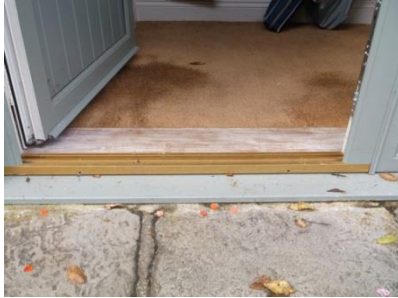
Front door tread

Doors: All doors are between 800 mm and 910 mm wide. Door handles are at an accessible height to a wheelchair user.