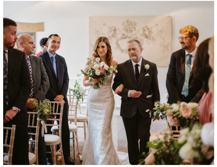
THE COURTYARD ROOM

The Courtyard Room is a favourite amongst couples for both ceremonies and dancing. With its stunning exposed brick walls, the space feels bright and airy for daytime ceremonies, transforming into the perfect dancefloor for your evening reception, providing ample space for live music and the opportunity to dance the night away.